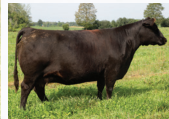
JL LADY 6125 | GRANDDAM