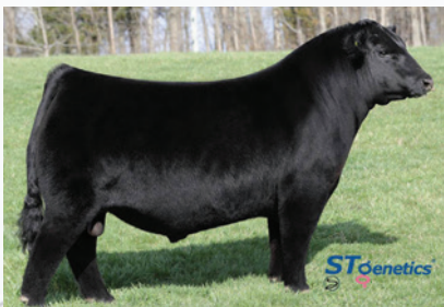
CONLEY DIECKMANN PROWESS | SIRE OF LOT 12A