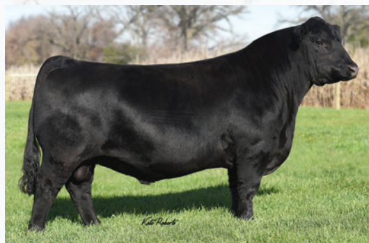
SAC CONVERSATION | SIRE