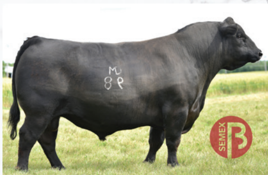
MOGCK SPECIALIST 98 | SERVICE SIRE