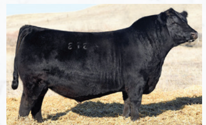
COLEMAN BRAVO 6313 | SIRE OF LOT 10