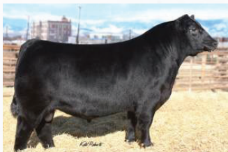
MUSGRAVE SKY HIGH 1535

When Kelly and I first set out to raise and breed cattle under our own prefix, we promised each other we would sell the good ones - so here she is! This heifer hit the ground with an explosive hip and muscle mass, with clean lines and a standout profile. She continues to be a favourite in the pen while her mother is quickly becoming a favourite out in pasture as an easy doing producer with a picture perfect udder. On top of her impressive phenotype, this heifer has the sweetest personality and has been worked extensively, making her an ideal show prospect for a junior of any age.