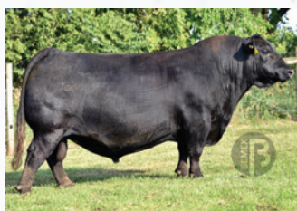
MUSGRAVE 316 COLOSSAL 137

This yearling heifer has future brood cow written all over her. She's deep-sided, long spined and if her udder is anything like her mother's, she will make one fine cow. 9J is halter broke and very quiet. Bred to the powerhouse Colossal for an early January calf. Something to look forward to.