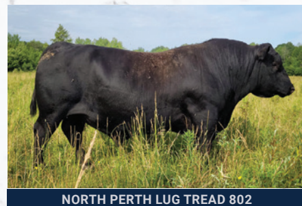
NORTH PERTH LUG TREAD 802