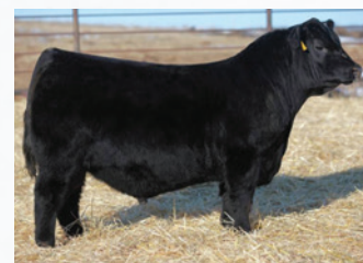
BROOKING FIREBRAND 6068