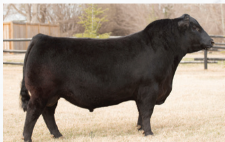
ADA CHALLENGER 119C | MATERNAL BROTHER TO LOT 21, SOLD TO BLAIRS AG