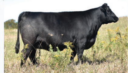
ANGUS HILLS ANNE 18G | DAM OF LOT 11