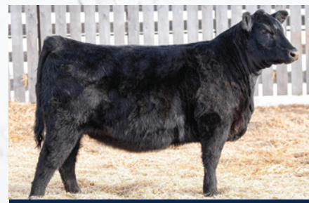
PATERNAL SISTER TO LOT 40 AT BAR E L