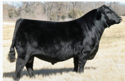
5T POWER CHIP 4790