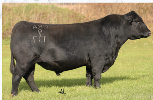
CRAWFORD GUARANTEE 9137 | SERVICE SIRE