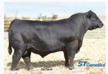
MUSGRAVE CRACKERJACK |SIRE

Miss Stout 10K is a long bodied, stylish CrackerJack daughter. With the influence of her Stunner sired father Crackerjack, she is a powerhouse in the making. Haltered and sells open.