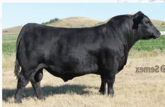
KR CASH FLOW | SIRE