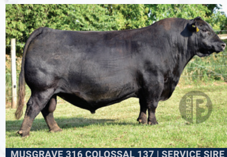
MUSGRAVE 316 COLOSSAL 137 | SERVICE SIRE