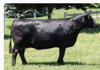
NORTH PERTH BLACKCAP MAY 713