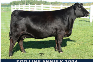
SOO LINE ANNIE K 1094

PVF INSIGHT 0129 RCF ANNIE K 908 SOO LINE ANNIE K 1094