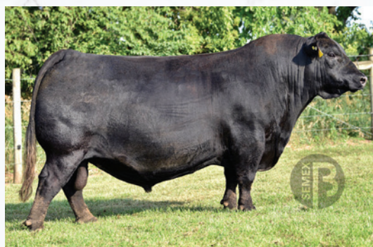
MUSGRAVE 316 COLOSSAL 137 | SERVICE SIRE