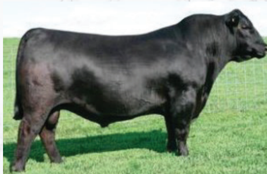
S A V BISMARCK 5682 | SIRE OF LOTS 4 AND 5