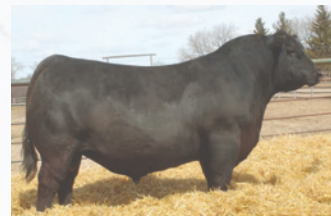
ELLINGSON PROFOUND 8155

This is the first time we have ever consigned a mature female and we feel that she is one that will work in any herd. This is a very exciting cashflow daughter with a beautiful udder that is designed for longevity. 25G has a tremendous profile with a deep, sweeping rib and a wide top. She is bred back to Ellingson Profound on April 19th and due to calve January 26th. Don't miss her on sale day!