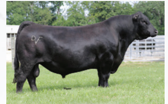
DEER VALLEY GROWTH FUND

Miss Stout's pedigree combines the show style from First Impression and the power of Connealy Final Product. Her early AI service to the powerhouse Growth Fund bull will just continue to add to this stacked pedigree. Miss Stout is a beautiful stylish 3 year old in her prime. Her awesome Crackerjack heifer calf at side is a testament to more great ones to come. Haltered and quiet. AI bred to Deer Valley Growth Fund on March 23, 2022. Preg checked safe.