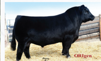
PM THUNDERSTRUCK 22'13 | FULL BROTHER

CNS is very excited to partake in the Eastern Extravaganza sale and we are extremely pleased about our offer this year. We got some advice when we first started out to always sell the best ones! CNS Rosebud 4K is a full sister to the multiple time Champion bull PM Thunderstruck. Need we say more! I had the opportunity to tour Popular Meadows a few years ago and I was very impressed with the depth of Tanya's breeding program. We ended up purchasing some embryos from the famed Rosebud cow family. We hope CNS Rosebud 4K will follow in her brother's footsteps but more importantly turn into a great cow prospect. When the thunderstrikes this time you might better be the one buying this opportunity.