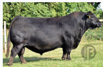
MUSGRAVE 316 COLOSSAL 137

This Colossal daughter will catch your eye with her thickness and Style. The best part of this February baby is her beautiful profile and deep rib! Oh and don't forget her numbers!!! BW = 1.9 and YW = 105!! She will make a great junior project!