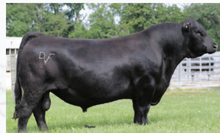
DEER VALLEY GROWTH FUND | LOT 39 SERVICE SIRE