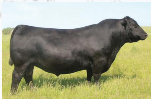
S A V RAINFALL 6846 | SERVICE SIRE