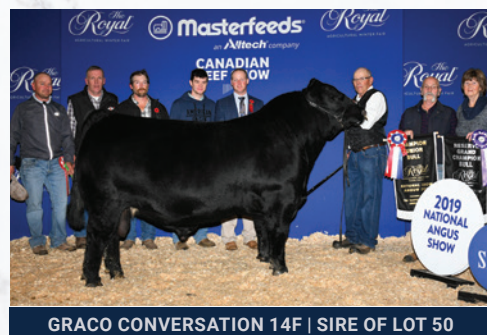
GRACO CONVERSATION 14F | SIRE OF LOT 50