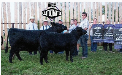
WORTH-MOR SHAKURA 5E | MATERNAL SISTER TO LOT 9