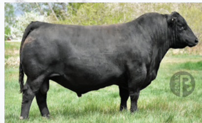
SCHIEFELBEIN ATTRACTIVE 4565