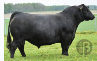
LA JUANITA SMX BOMBAZO 6029

This could be one of the most interesting pedigrees we have ever offered for sale! Sired by LA Juanita Bombazo who is a bull from Argentina X the popular SAV Blackcap May family from SAV you have to agree this pedigree screams power and performance! AI bred to S A V Rainfall 6846 on April 25, 2022. Preg checked safe. CONSIGNED BY WORTH-MOR CATTLE